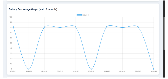
Figure 3: Battery Percentage Variation Over Time

The proposed DNN-based approach achieves the highest prediction accuracy while maintaining low computational complexity.