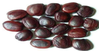
Fig.2. Tamarind seeds