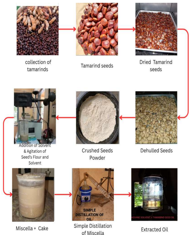
Fig.3. Extraction of tamarind seed oil

to get cake and miscella as products. Filtrate i.e. miscella is distilled by simple distillation for the recovery of oil solvent for 15 minutes. Physical and chemical properties of an oil are tested.