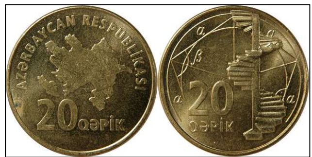
Figure 1. The Azerbaijan 20 qəpik coin

The observe design includes the following characteristics: