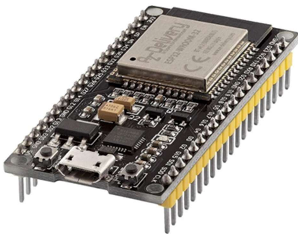
Figure 3.4.1 ESP32 Microcontroller.

The ESP32-CAM module is incorporated into the system to enable live video streaming of the location of the incident.