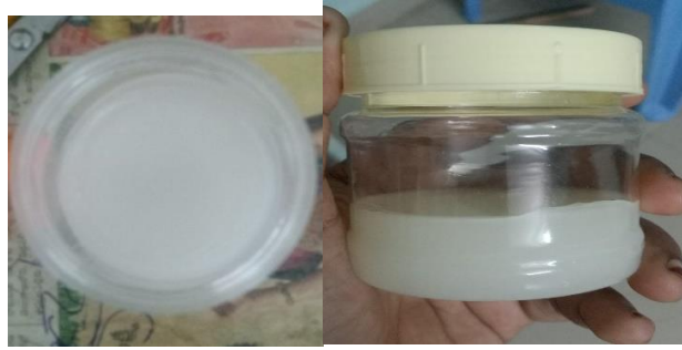
Figure:1 nasal balm

SPREAD ABILITY: the spread ability values demonstrate that a little makes the balm easily spreadable. The formulation(F1) demonstrated a spread ability of 2.4 cm at room temperature. which is better composed when compare to the marketed balm. The test of spread ability consisted of applying product at room temperature of 2.0 \pm 3.0 the C^0