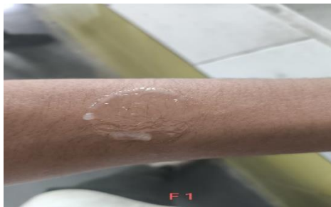
Figure no:4 skin irritation (F1)

After applying the natural nasal balm skin for few hours, there are no signs of skin irritation it present the cooling sensation on skin were observed. The primary irritation test that the nasal balm formulation caused no irritation.