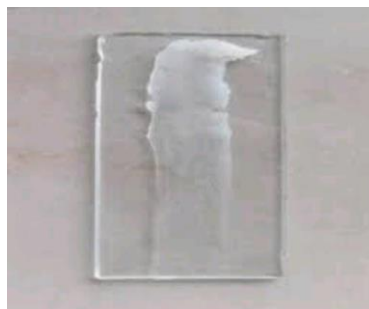
Figure no:2 formulation(F1)