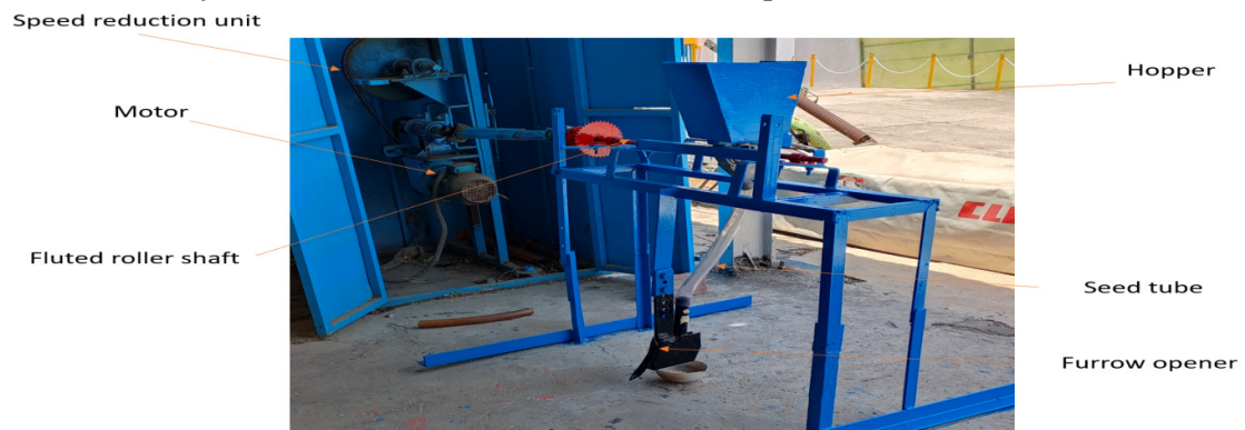
Fig. 2 Developed model for detection of blockage

The model was designed to measure blockage detection, essential for sowing machines. The entire model focuses on a single furrow. All aspects of its construction, components, configuration, and design were based on this. It has a seed hopper, shaft, flute, seed tube, furrow opener, and frame. A motor connects to ensure smooth operation and control. The motor has a regulator to adjust system speed. Seed rate can be adjusted by the flute exposure length. The blockage detection sensor is strategically positioned and the model allows focused development and testing of the detection system for a single furrow. The motorized system enables control over seed rate and speed.