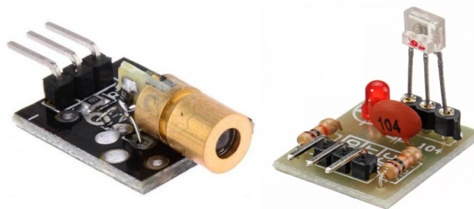
Fig.1 Laser module and Laser receiver module

The laser receiver module is utilized to accurately read the incoming signal. It provides a digital output, which is high when the laser is detected and low when the laser is not detected. This module plays a crucial role in capturing and interpreting the laser signal, ensuring precise detection and reliable performance.