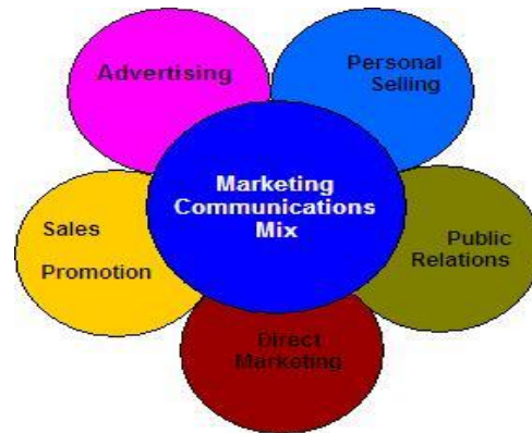
Fig no: 1.1

Promotional mix includes five elements they are personal selling, advertising, sales promotion, direct marketing, and publicity.