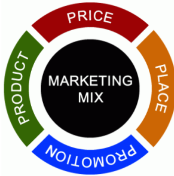
Fig no: 2