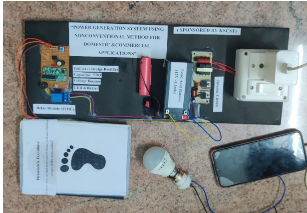
Fig. 3 Hardware Model

We developed and implemented a low-cost power generation system with piezoelectric sensors, and the voltage is generated as a result of the applied pressure. Based on the pressure applied to the piezoelectric sensor, a significant amount of voltage is produced which can be used for a variety of applications.