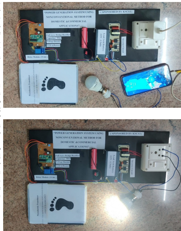
Fig. 2 Results of the Project