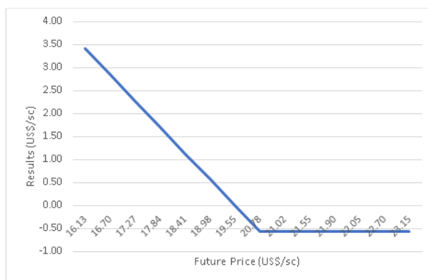
Fig. 1 Result for the producer purchasing a Put.

Following the behavior of the prices of the contract due in November, on 10/19/2020 (with a month remaining to expire), it appears that a date on which the seller could have sold the option was on 8/10/2020 when the price was US$ 19.12 / 60kg. Graphically, the exercise of the option would be as follows: