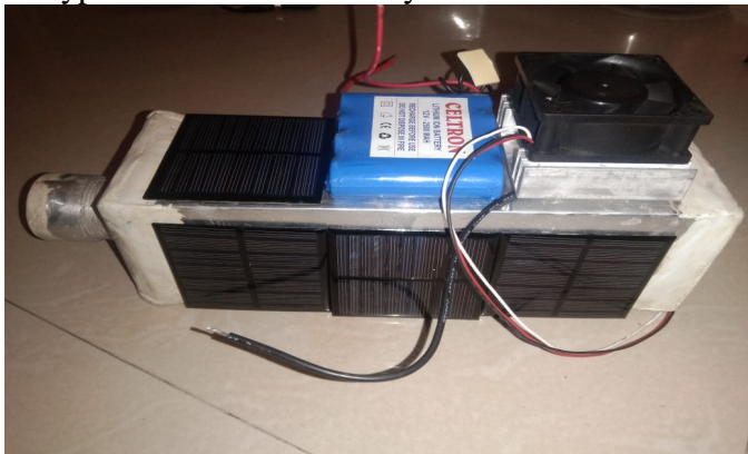
Actual solar cooler model

Team-mate of the heat sink, is not visible. It's the ambient air with its temperature, where that heat will be dissipated. Some components are important in a total application. These are example temperature sensors, a software to configure and monitor the TEC controllers, a fan and of course the power supply.