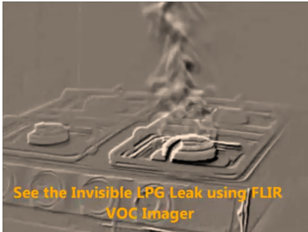
[11] fig 1: The video demonstrates the Invisible Gas Using FLIR Thermal Imager.