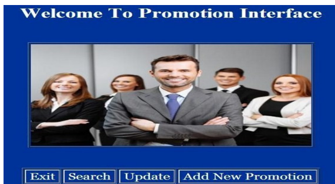
Figure (2): Promotion main page