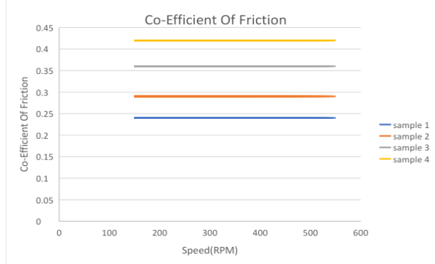
Fig.5. Speed Vs Coefficient of friction

From the graph, it is observed that the coefficient of friction remained constant for various range of speed(RPM).The constant value observed may be due to absence of steel fibres as stated and reported that coefficient of friction will increase if steel fibres are used due adhesion of steel particles or maybe the absence of trapped asperities[14]. In the sliding surface, the composition of the same changes their coefficient of friction also changes due to various properties of the