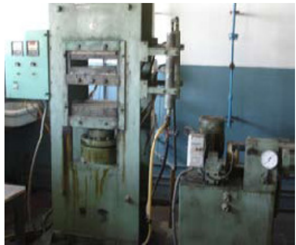
Fig . 1 Compression moulding machine

The initial process flow involves preparation of coconut shell and graphite powder by carrying out processes like removing of shell fibres from coconut and washing the obtained shell with soap and detergent, followed by cleaning using a clean dry cloth and drying it in the oven at 150 °C for nearly 3 hours. After that, crushing the dried coconut shell using mortar and pestle is done and fine grain size of 100 micrometres is obtained. The sieve size of 100 micrometres of Coconut shell was added in varying percentages to Aluminum oxide, Graphite and epoxy resin based on 176 g weight of commercial brake pad. To achieve homogenous steady-state condition for the moulding process, each sample combination is separately dry-mixed using a blender.