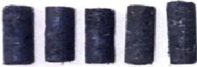
Fig. 3 sample compositions