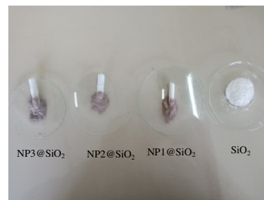
Fig 1. Mesoporous silica and NP@ \text{SiO}_2 picture.

Impregnation of \text{Fe}_3\text{O}_4\text{-Fe}_2\text{O}_3 nanoparticles into mesoporous silica was successfully done. Three types of \text{Fe}_2\text{O}_3\text{-Fe}_3\text{O}_4 nanoparticle mixture synthesized with different \text{FeCl}_3 concentrations (0,072 M, 0,036 M, 0,03 M) is symbolized with NP1, NP2, NP3. The mixture of nanoparticles that been impregnated into mesoporous silica is symbolized with NP1@ \text{SiO}_2 , NP2@ \text{SiO}_2 , NP3@ \text{SiO}_2 . The mixture of \text{Fe}_3\text{O}_4\text{-Fe}_2\text{O}_3 was successfully impregnated into mesoporous silica forming a homogenous mixture of blackish gray which can not be distinguished between mesoporous silica with the mixture of \text{Fe}_3\text{O}_4\text{-Fe}_2\text{O}_3 nanoparticles, as can be seen in picture 1 below.