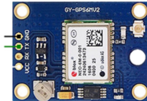
Fig: NEO 6M MODULE

is used along with the GPS of NEO 6m module. The GPS module is mainly used to track the location based on the current latitude and longitude positions. Once the GPS module gets the location regarding latitude and longitude position it is transmitted through transmitter and it is then received by the receiver in the node MCU ESP8266. At first the collected information can be viewed using serial monitor in the Arduino IDE.