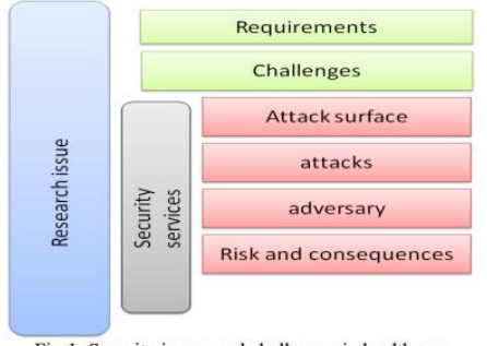
Fig 1. Security issues and challenges in healthcare

IoT is growing rapidly. In the coming years, medical departments are expected to witness the spread of IoT and to boost new e - Health IoT devices and applications. Medical devices and applications are expected to process important personal data, e.g., personal medical data. Additionally, such smart devices can connect to the global information network for access at all times regardless of their location. Therefore, IoT's medical domain can be the target of an attacker. As shown in Figure 1, and from the viewpoint of medical needs, to promote the complete introduction of IoT in the medical field, it goes without saying that it is crucial to recognize and scrutinize individual functions of IoT privacy and security. In addition to that, security regulations, weaknesses, risk assessments, and incidence response should also be identified.