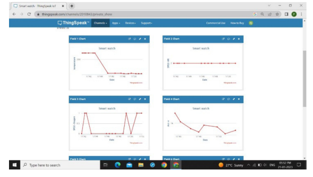
Fig. 1 Real time graph of oxygen, heart rate, accelerometer and temperature rate of an user

Fig 1 is the real time graph obtained on thingspeak cloud of various health parameters. This cloud will keep record of these parameters which will be helpful for future analysis of health of a user. This data can be accessed by third person(Guardian) or doctor to find record of various health parameters of the user.