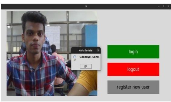
Fig.4:User logs out