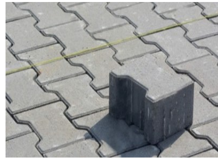
Fig-1: Interlocking paving bricks