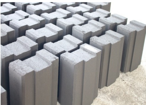
Fig-5: Concrete interlocking bricks