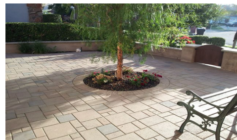
Fig-3: interlock landscape brick