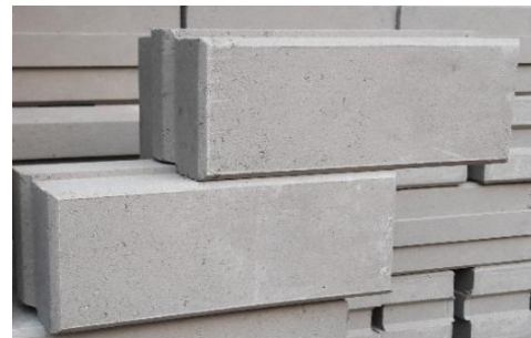
Fig-2: interlock wall brick