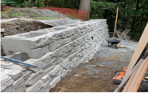
Fig-4: interlocking retaining wall bricks