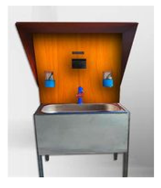
Figure 4: The Prototype

that works efficiently. Following development, a survey was distributed to users to ascertain their opinions of the device's reliability, usability, and functionality.