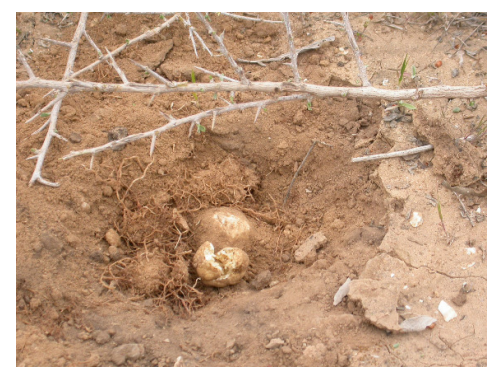
Fig.1 Choiromycesmeandriformisascocarp next toAcacia cyanophylla plant

This is the first report on C. meandriformis presence in Tunisia. Harvested ascocarps were generally spotted reddish brown. The mean characteristic of C. meandriformis is its typical odor when mature this aroma specially overpowering and nauseous. The glebe was composed of numerous whitish-ferruginous fertile veins. The nearness plant species to C. meandriformisascocarpes location was only Acacia cyanophylla (Fig. 1), some ascocarps were found attached to roots of this plant species. The soil analysis of C. meandriformis site, showed aclaysubstrate with low alkaline pH (7.94), relatively rich in organic matter (3.61%) and totally deprived of available phosphorus (0 ppm).