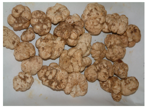
Fig. 2 Choiromycesmeandriformisfruiting bodies.

C. meandriformis ascocarps have irregular form, with ochre to gray smooth surface (Fig. 2). Globose spores are yellow-brown with truncate spines ornamentation. There were always eight spores in each ascus of C. meandriformis (Figs 3). This Ascomycete belongs to Tuberaceae family.