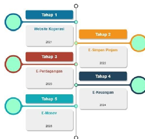
Fig. 3 Application Implementation Sequence Roadmap

The analysis was carried out on the Syari'ah An-Nisa' Sidoarjo Consumer Cooperative and the enterprise architecture planning using the TOGAF ADM method. The principles that will be used for the pattern in planning are as follows: The architecture that is made must be in accordance with the vision, mission, goals, main tasks and functions of the An-Nisa' Sidoarjo Sharia Consumer Cooperative.