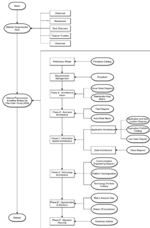
Fig. 2 Framework for Thinking (Widyarningsih, 2014)

Phase F -> Migration Planning: In this migration planning phase, migration planning will be carried out for the implementation of the new application architecture that was built in the previous phase.