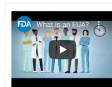
(Fig. 2)

During a public health emergency, the FDA can use its Emergency Use Authorization (EUA) authority to allow the use of unapproved medical products, or unapproved uses of approved medical products, to diagnose, treat, or prevent serious or life-threatening diseases when certain criteria are met, including that there are no adequate, approved, and available alternatives.