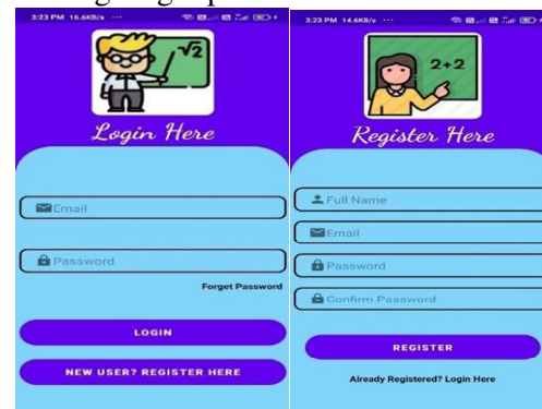
Fig. 2 Teacher's Login and Register Activity