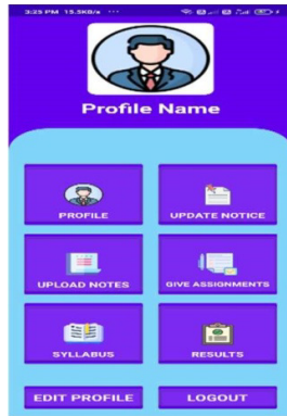
Fig. 3 Teacher Dashboard