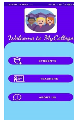
Fig. 1 Home Menu of Application