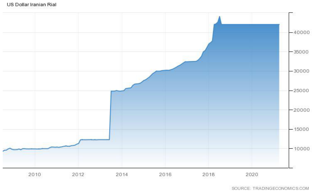
Figure 3. Central bank currency rate for import and export in Iran 2010-2020.

As shown in the figure 3., Iran has two currency rates, one of which is set aside for importers and exporters. The Central Bank of Iran is in charge of managing the flow of dollars into the country. The difference between market and central bank rates is usually large, and this gap allows market brokers to take advantage of the situation to maximize profit. Brokers, who can be either officials or locals, borrow money from the Central Bank in order to import or export the purchased goods. In exchange, the brokers either sell the dollars to the banks or sell them to the free market.