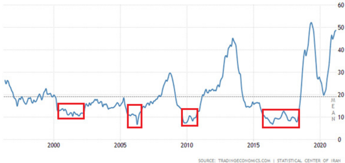
Figure 2. annual inflation rate in Iran 2000-2020.

Source: tradingeconomics.com/Iran/inflation