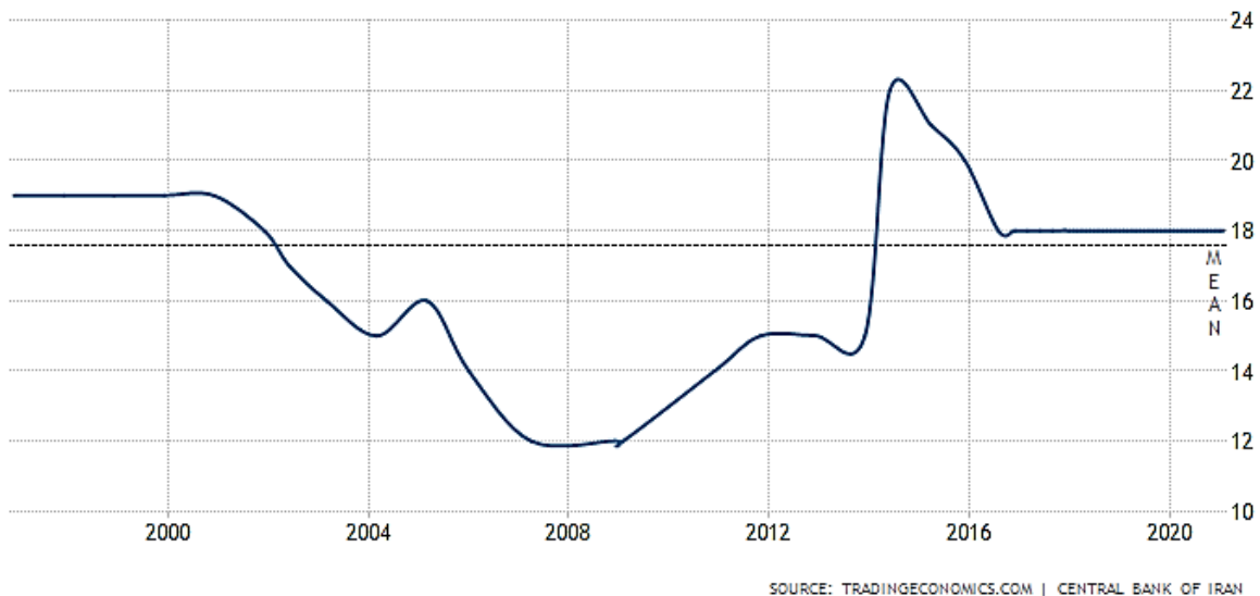
Figure 1. interest rate in Iran from 2000-2020.

As illustrated in Figure 1, the average inflation rate in Iran over the last three decades has been approximately 18%, according to the Central Bank of Iran. These statistics, along with others,