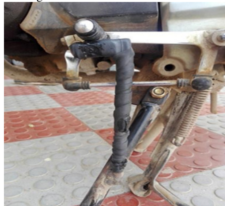
AUTOMATIC MOTOR CYCLE SIDE STAND SLIDER

Motorcycle is generally provided with a side stand to support when they are not in used. The side stand usually comprises of a bar or rod which is attached to the lower portion of a motorcycle frame and movable to a laterally down widely extending portion so that the motorcycle can be tilted against and rest upon the bar. When the motorcycle is in use, the bar is swing upwardly and along the frame so that it will not interfere with the running of the motorcycle.