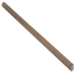
Cast iron rod

Cast steel is an alloy, which is produced by pouring molten iron into a mold. Nonferrous metal rods. Nonferrous metal rods can be defined as rods that do not contain any iron or iron alloys. Some common nonferrous metals that are used to make rods are aluminum, copper, cobalt, nickel, refractory, and titanium.