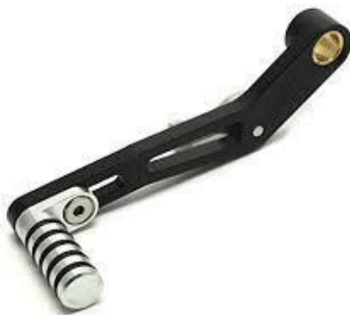
Lifting gear lever

Lifting lever is the third major component of the system, the lifting lever is the rectangular rod made of MS- rod, which consists of two lifting leaves which is mounted with the edge of axle. The lifting leaves should be parallel to the sprocket pinion. The lifting lever is composed of two metal rods. Where both are welded at either side of the axle. The free ends of the lifting leaves are tapered well. The ends are machined well for tapered shape for smooth engaging with pushing lever. Lifting lever this smooth engagement leads proper retrieving of side-stand. This tapered surface makes the lifting lever as capable to withstand engine impact. When stand is moved vertical in position, the pushing lever engages with lifting leaves. This may not possible in all time, since the angle of lifting lever maybe any degree. So, due to effect of freewheel and tapered surface of the lifting lever can adjust itself.